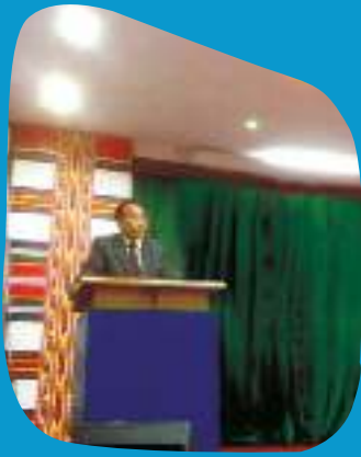
Prize distribution to APLL students