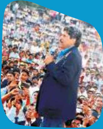
Mr. Kapil Dev addressing APLL students