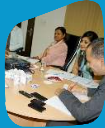
Business Review Meeting