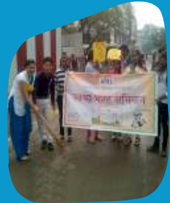
Swachh Bharat Abhiyan