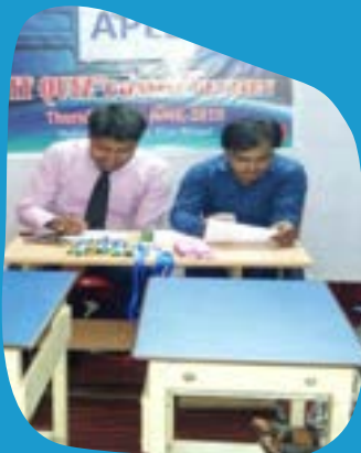
Quiz competition, Drawing competition