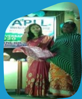
Blanket Distribution Food Distribution