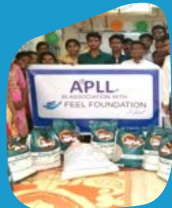
Food Distribution, Rangoli Competition