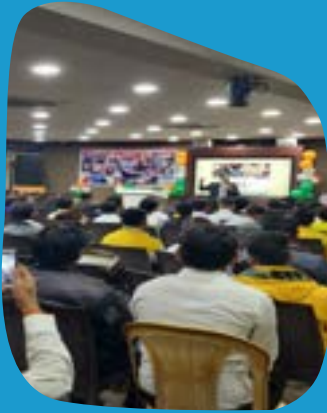
Training Empowering The Trainers