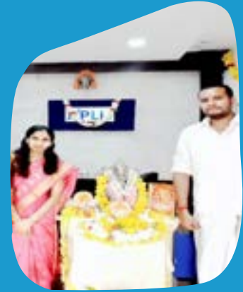
Celebrating Deepawali Celebrating World Literacy Day