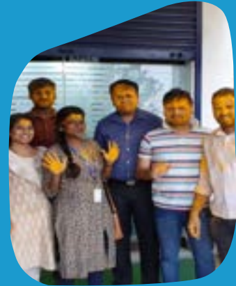
Holi Celebration Certificate Distribution Program,