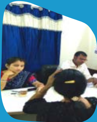
Placement Drive & Campus Drive