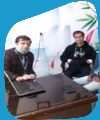
Faculty Training, Youth Integration