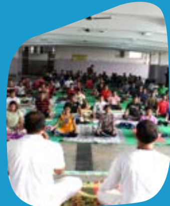
Yoga Camp, Eye Donation Camp